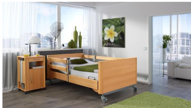
Produkte mit Herz und Verstand