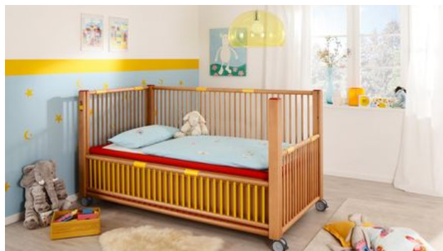
Produkte mit Herz und Verstand