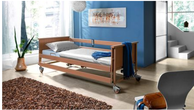
Produkte mit Herz und Verstand