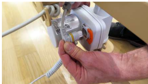
Insert the plug completely into the socket.

Now insert the plug into the socket on the lifting motor in such a way that the cable comes from above.