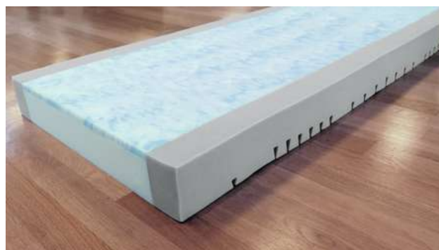
The reinforced edge zones of the Sky-fit (pictured here) and Comfort-fit models make it easier to get up and reduce the risk of rolling to the side of the bed at night.

The mattresses of the Fit series are available in medical supply stores. For people in need of care and their relatives, they offer a great plus in quality of life. For retailers, they are a good opportunity to present customers with an attractive additional offer together with the care bed. With mattresses from Burmeier, you will still be floating on cloud nine long after Christmas.