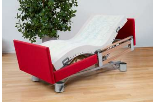
The layer of Sky-therm® foam (blue grained) is pleasantly elastic – seen here on the Sky-fit model.

The heavy-duty Cloud-fit model even has an additional cold foam middle layer. With a total height of 16 cm, the Cloud-fit is particularly suitable for people with a body weight of 140 to 240 kg – but of course also for everyone else who wants extra space and comfort in bed. The Cloud-fit will also be available in 120 and 140 cm widths, making it ideal for use in our Allura and Gigant heavy-duty beds.