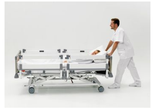
Where is the directional castor? Our experts provide the information.