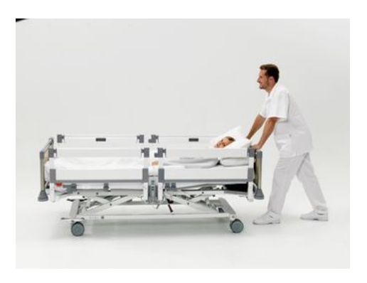
Where is the directional castor? Our experts provide the information.