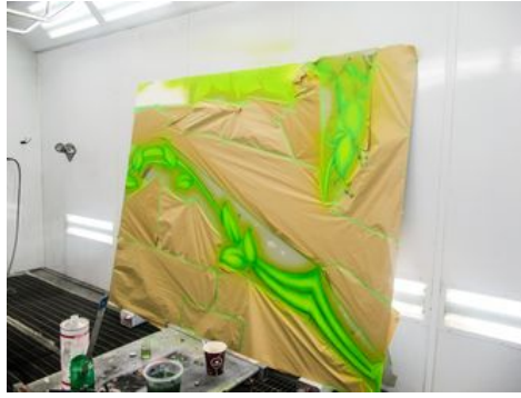
This is where the green leaf pattern is created.

Some of the visitors to the 'Altenpflege' fair wanted to buy the unique bed on the spot, while others asked what the idea was behind this work of art. For Stieglmeyer, the flowery Venta bed bridges the gap between technology, culture and nature. It symbolises our core values: We wish to improve the quality of life of those in need of care with safe, cosy and attractive beds. At the same time, we place great emphasis on sustainability and protecting the environment in the course of our work.