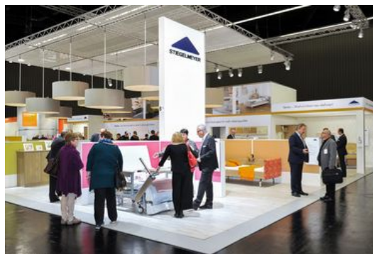
The Stieglmeyer stand in Nuremberg impressed visitors with its bright colours.

The Venta care bed was one of the stars at the 'Altenpflege' fair in April – not just as a one-off painted model, but also in its original form. The safe and comfortable low-height bed won visitors over in Nuremberg with its modern safety sides, its appealing feel-good looks and the optional Softcovers in many attractive colours.