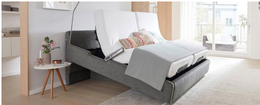
suite eMotion comfort bed.

The suite eMotion comfort bed impresses patients, guests and staff in first-class rehabilitation areas and hotel rooms. The mattress surface can be moved to a comfortable armchair position by remote control. Due to its height-adjustability, the bed is also suitable for physiotherapeutic tasks. The visual appearance of the eMotion suite can be adapted to the finest tastes with three lines of design.