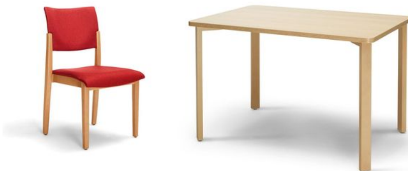
Tables and chairs.

The chairs of our Mavo and Fena series provide comfort and elegance in patient and common rooms. Stable, matching tables serve for reading, writing and dining.