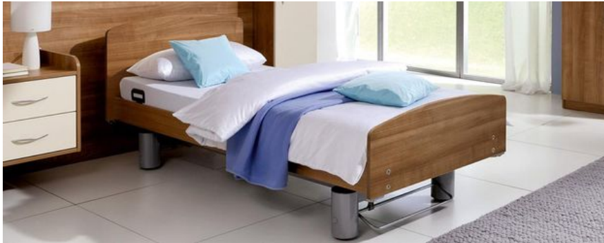
Elvido reha care bed.

The Elvido reha is a care bed for the special requirements of rehabilitation. With its 4-section mattress base and a wide range of height adjustment, it adapts precisely to the needs of the patient and allows for back-friendly, comfortable care work. At the same time, the absence of safety sides is ideal for mobilising the patient. Decors, head and footboards in a cosy, home-like design create a positive atmosphere.