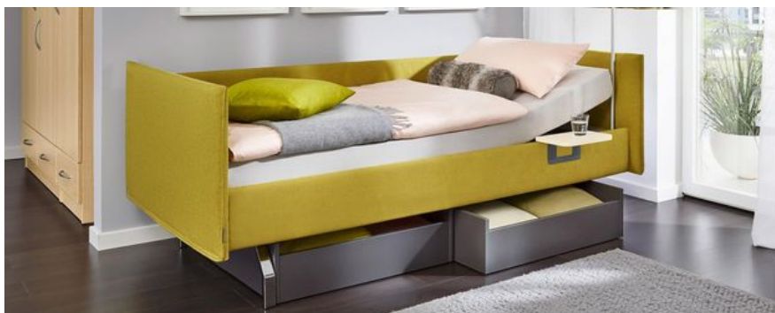
Carino residential home bed.

If patients in rehabilitation are able to move more independently, the comfortable Carino bed is a good choice. With its manually adjustable backrest, it offers comfortable positions to read or watch TV. The Carino is also excellently suited for nurses' residences due to its individual design possibilities.