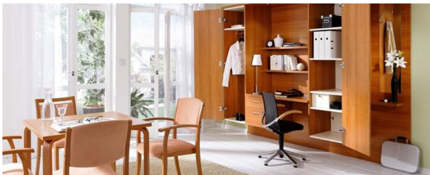
Adrano furniture programme.

Our Adrano furniture system turns every rehabilitation room into a home. Wardrobes, cupboards and desks in attractive decors blend together to create a homelike interior. They offer plenty of space to store clothes and valuables in a safe and handy place.