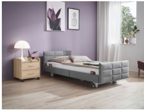
Quilted head and footboards for our Elvido and Libra models create a wonderfully homelike atmosphere – here the box design in a cutting-edge colour scheme.

This raises the question of colours again: What tone should the upholstery be in to be up-to-date? What are the trending colours of 2021? The usual candidates grey, brown and beige or rather a bright green?