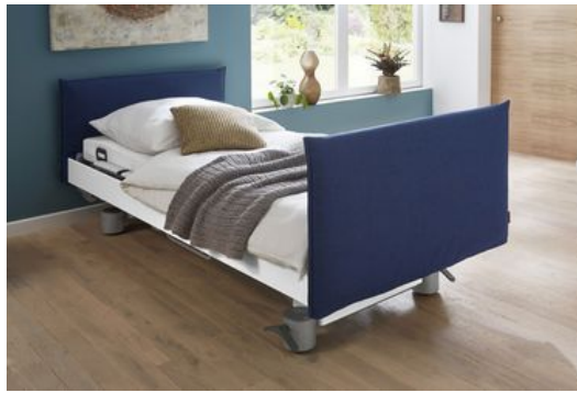
Fashionably up-to-date: the Venta care bed with midnight blue soft covers and white side panels.

Would you like an upholstered care or comfort bed from Stiegmeyer in one of these cutting-edge colours? Then take a look at our renowned partner Delius and indulge in the large selection of homelike, easy-to-care-for fabrics. The Ambra Deligard series, for example, offers almost all modern shades from rich yellow 2550 to sea blue 5552.