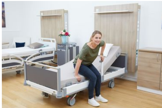
Did you know?

After lowering the bars at the foot side of the bed, both support elements will automatically fold down with a cushioned effect. On the head side, however, only the outer support element lowers by itself. The middle element remains upright as a mobilisation support.