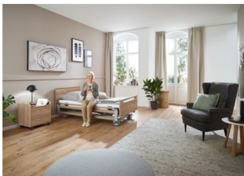
The new Regia with Easy-Switch system offers more flexibility, convenience and appeal.