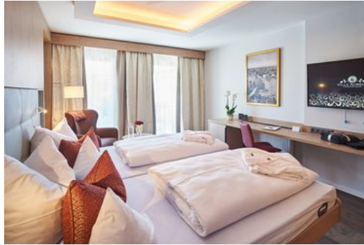
Elvido vervo nursing beds are combined into double beds for couples in the Villa Aurelia.

Yes, but not by ours at that time. My great-grandfather worked here as a masseur and my father was able to buy the clinic. We are a real family business; several generations work in the clinic. This family character also includes a cosy, home-like atmosphere. The visual environment of a classic hospital would not suit us.