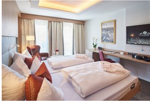
Elvido vervo nursing beds are combined into double beds for couples in the Villa Aurelia.

Yes, but not by ours at that time. My great-grandfather worked here as a masseur and my father was able to buy the clinic. We are a real family business; several generations work in the clinic. This family character also includes a cosy, home-like atmosphere. The visual environment of a classic hospital would not suit us.