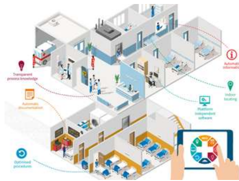
Stieglmeyer develops digital solutions for the "Smart Hospital".