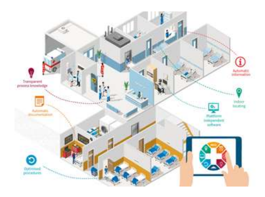
Stiegelmeyer develops digital solutions for the "Smart Hospital"