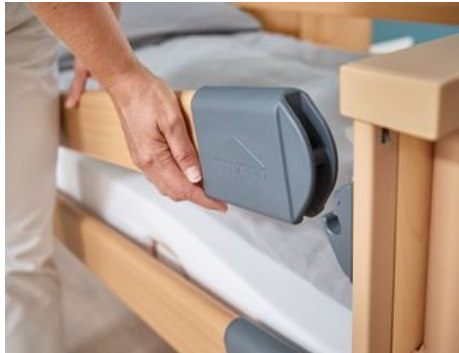
With the new Easy-Click system, the safety sides can be clicked on and off within seconds – a great relief when assembling and dismantling the bed.

The new Dali-Lock app enables the locking and unlocking of individual adjustment functions with the smartphone. Burmeier thus opens the door to the smart home world: In the future, apps should play an increasingly important role and support people in homecare in many situations. Soon there will be a Burmeier app for retailers and users with lots of useful information about our products and links to our videos and social media channels.