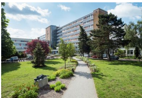
Klinikum Südstadt Rostock

After 27 years in my department, I sometimes believe that we've achieved our goal – but then I keep coming up with something new that could be optimised. For example, we have had all the electric beds retrofitted with a new holder for the handset. This keeps the handsets much better protected against damage. It is important to always keep moving forwards.